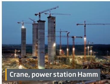
Crane, power station Hamm