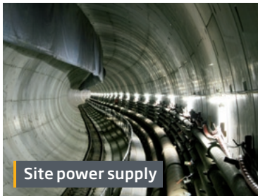
Site power supply