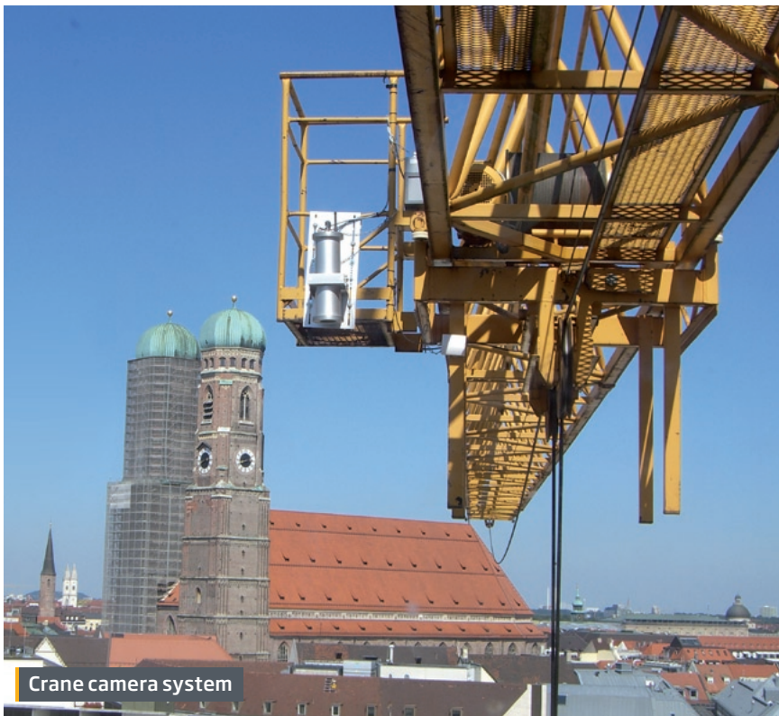
Crane camera system