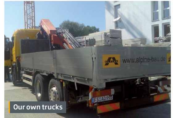
Our own trucks